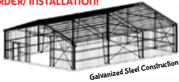
Galvanized Steel Construction

Barns/Carports Free Span/Garages Hay/RV Storage Triple Wides/Utility (12 or 14 gauge legs/29 gauge panels) Lic#MARL0MB8000L