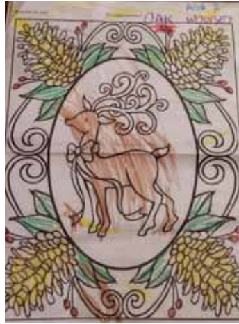
Thank you Oak Woolsey, age 2, for the beautiful reindeer!

So let's just stick to kissing under it.