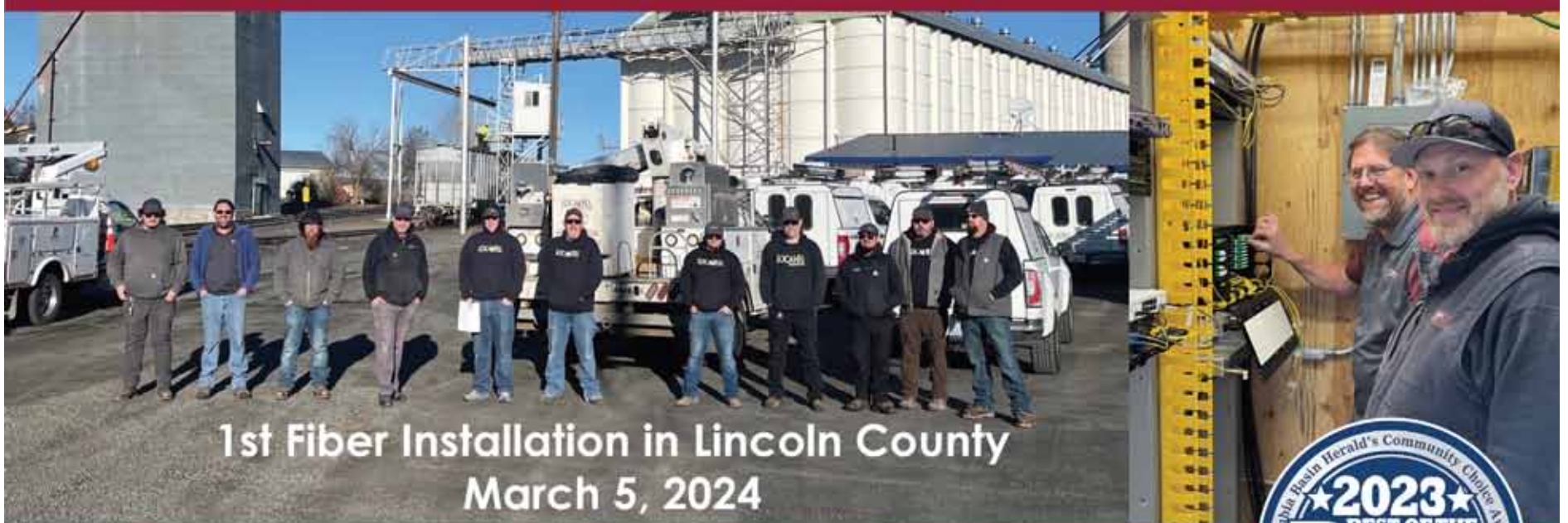
1st Fiber Installation in Lincoln County March 5, 2024

Contact us now to be notified when fiber is available at your location.