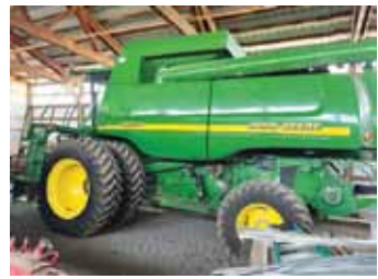
2000 John Deere 9650STS Combine, Sep hrs 2,669+- $49,500