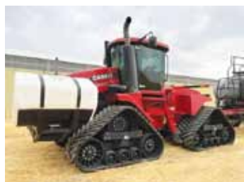
2011 Case IH 550 Quadtrac, 5,233 hrs- $225,000