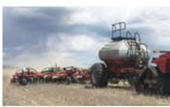
2013 Case IH 2280 Air Cart & 2013 Case IH FH400 Drill- $95,500 both