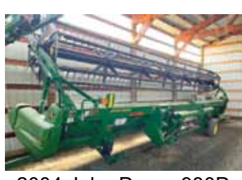
2004 John Deere 930D Header - $12,500