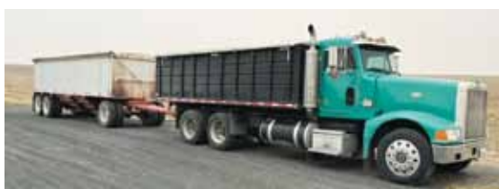
1995 Peterbilt 377 w/pup, 4,688 hrs- $44,500 SOLD

MORE ITEMS BIG AND SMALL. NON-AUCTION Some equipment may be sold before sale date.