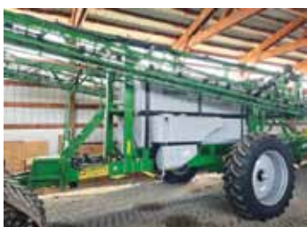
2014 Summers 90' Sprayer- $35,000