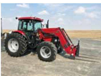
2008 Case IH JX95 Tractor, 595 hrs- $45,000 SOLD